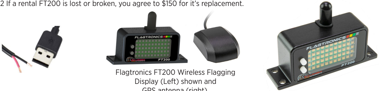
Flagtronics FT200 Wireless Flagging Display (Left) shown and GPS antenna (right).

6.2.4.2 If a rental FT200 is lost or broken, you agree to $150 for it's replacement.