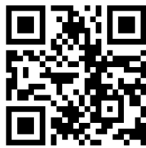
Event Driver & Crew Meeting

Download and read the ChampCar Endurance Series BCCR: