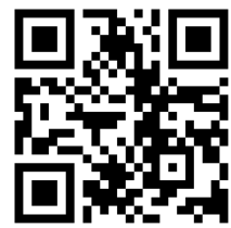
Event Driver & Crew Meeting