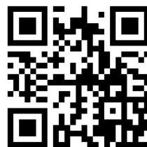
New To ChampCar Meeting

Golf Carts/Motorized Vehicles: All Golf Carts and motorized vehicles need to be cleared by SMI Properties. Information linked here. https://www.smiproperties.com/#csf62251 Phone Number: 704-454-1619 NO PITBIKES ALLOWED